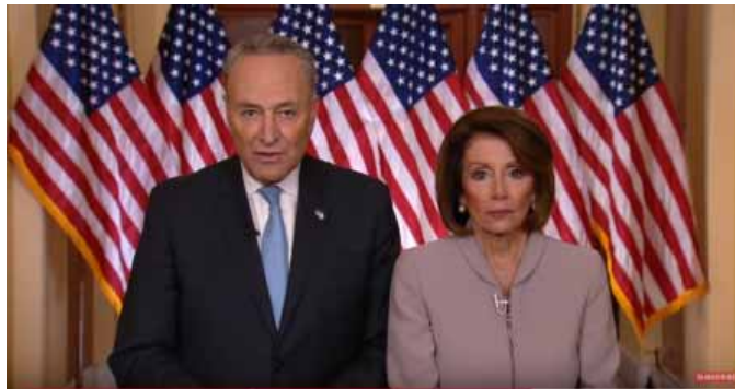
Senate Majority Leader Charles Schumer (D-NY) and Speaker of the House Rep. Nancy Pelosi (D-CA12)

Against that 39% approval rating, an argument can now be plausibly made that Democrats are, as far as national interests are concerned, simply evil. Indeed, that argument has recently been posited here . By failing to put the interests of the nation ahead of the political depredations of the Goofball Regime, they are not only facilitating and enabling the Goof, as noted here , they are his accomplices..., and they must be held accountable.