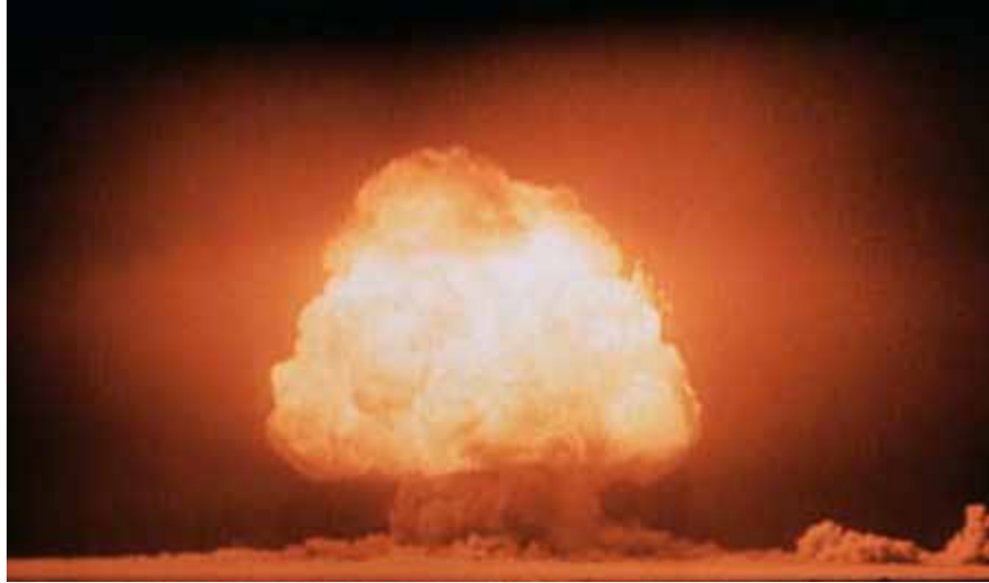
The " Trinity Detonation " of The Manhattan Project, July 16, 1945

(May 20, 2022) — In the jargon of thermonuclear physics, the term " critical mass " means that point at which a specific volume of fissile material – such as uranium-235 or Plutonium – will sustain a nuclear chain reaction. Once the chain reaction begins and races ahead uncontrolled, a hyper-violent nuclear explosion will occur. In short, that is how atomic bombs work.